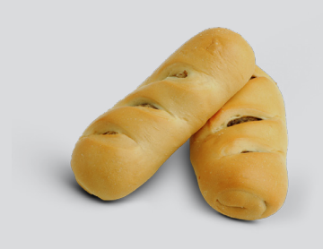
Mongo Roll Product Code: 300044