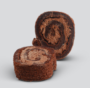
Choco Roll Product Code: 300167